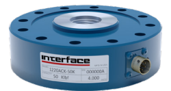
1220 Universal Precision LowProfile® Load Cell