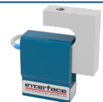
SM S-Type Load Cell