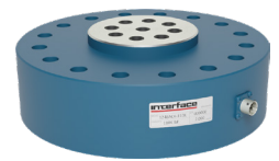
1248 Flange Precision LowProfile® Load Cell

PTB took on a significant project that would revolutionize wind energy competence by providing a way to reliably measure offshore wind turbines with the highest level of accuracy for the first time. The expansion of wind power can only be successful in global impact to our climate and energy needs, with ever larger wind turbines and machines capable of checking the quality of these systems.