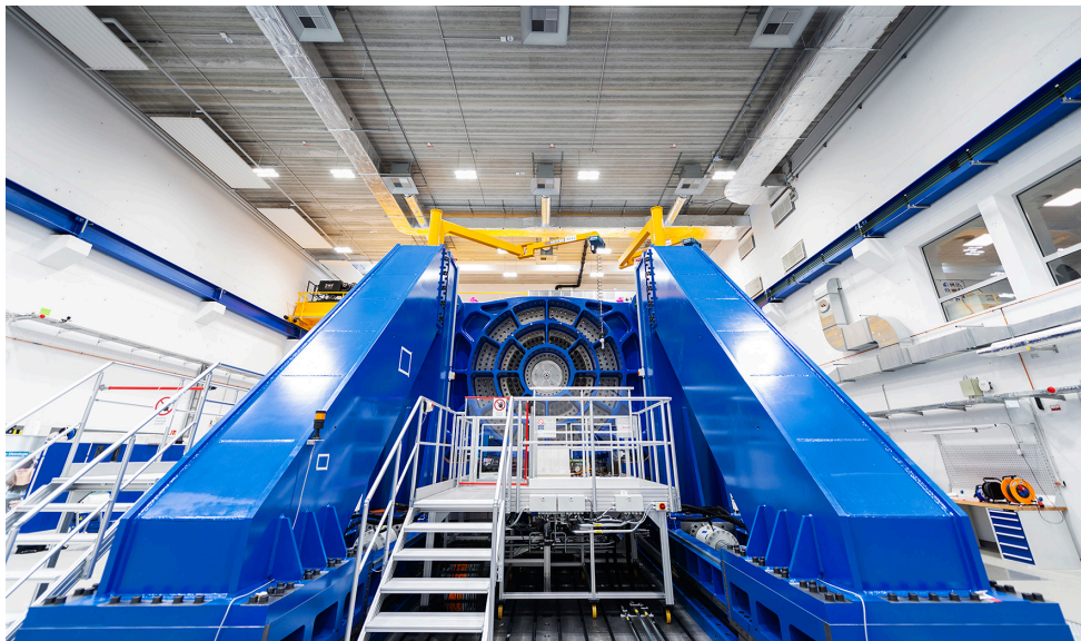
Figure 1-PTB's Torque Measurement System

Today, the system can allow multicomponent transducers to be calibrated in a traceable and practice-oriented way for force and torque. The system is also now the world's largest machine starting up at PTB, with which the large torsional forces that occur in wind turbines can be precisely measured for the first time. This unique torque standard measuring device is an essential part of PTB's Wind Energy Competence Center. Interface and our team in Germany are proud to have provided solutions that are truly capable of changing the future for our planet and all inhabitants.